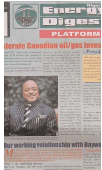
The CCAfrica mission to Nigeria in April attracted considerable media attention, including front page articles in the local trade press.

Benin Burkina Faso D.R. Congo North Africa (Morocco to Egypt) Tanzania