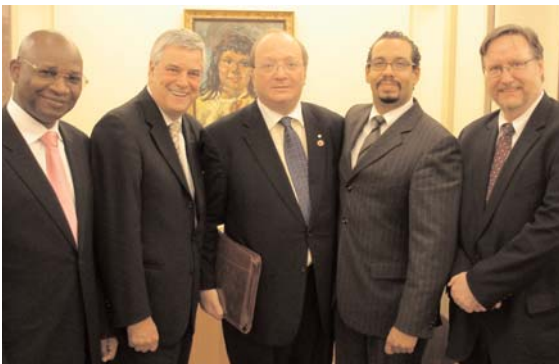
Senator Hugh Segal (centre) chairs a Senate Committee that is preparing a detailed report, due out in September, on Canada's relations with Africa.

NOTE: OUR NEW OFFICE ADDRESS IN OTTAWA Canadian Council on Africa 116 Albert Street, Suite 702 Ottawa, Ontario K1P 5G3 Tel and Fax remain the same