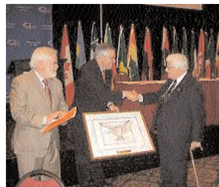
Paul Gérin-Lajoie (right) was recognized for his contributions to education and development during his political and public service career.

“First, allow me to thank you once again for your invitation to the Conference on Education and Economic Development in Africa, the events of which I found particularly interesting and relevant. You have also succeeded in covering a vast subject area in a limited amount of time, while giving a wide diversity of high-level stakeholders an opportunity to present their views. The Conference also allowed me to forge ties with many participants and the institutions they represent.”