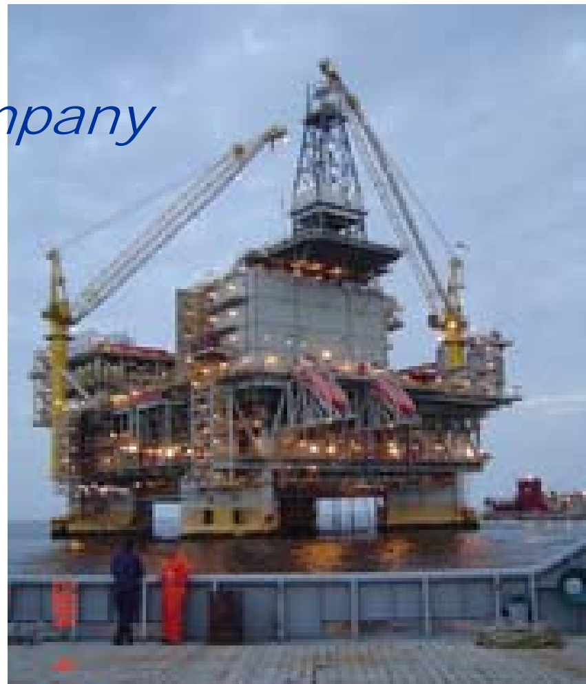
Exxon Mobil Kizomba A Platform

You can't look at any of these countries as a short-term approach