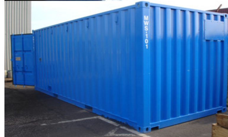
workshop container subsea