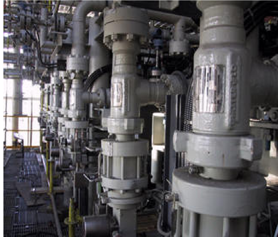
Exxon Kizomba A Angola P25 production choke hydraulic actuator FC2 manifold

After Sales Service is critical to longevity in the region